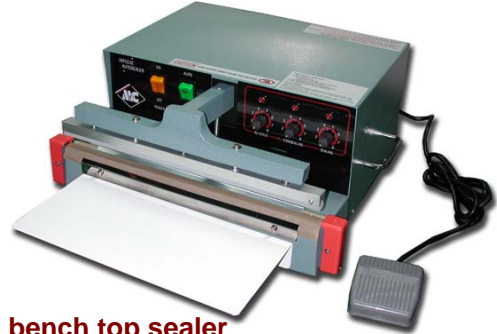
Automatic bench top sealer